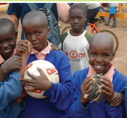
A treasured new ball, better than tied up plastic bags!