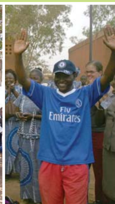
A new Chelsea Shirt, Burkina Faso