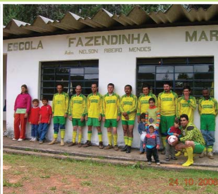
Dads line up in their new shirts in Brazil