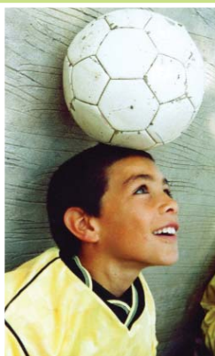
Keeping ahead of the game in Argentina