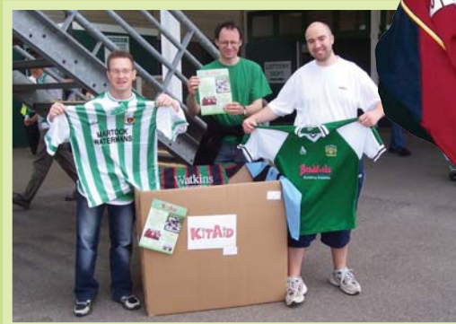
Yeovil Town supporters back the KitAid campaign.

Support for KitAid now comes from many clubs at the grassroots level right up to the Premiership. This year individual clubs have held kit collection days including: Yeovil Town, Stenhousemuir, Nuneaton Borough, FC United of Manchester, Witton Albion, Fleet Town and Chesham United. Fulham, Blackburn Rovers, Arsenal and Liverpool have also kindly donated kit which has all been received with huge smiles and often celebrations.