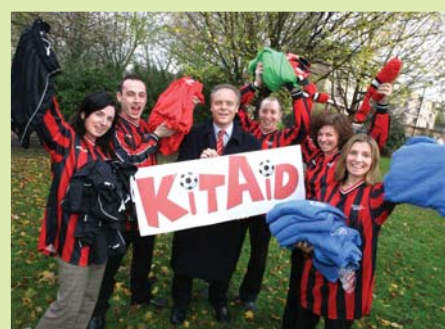
Veolia Environmental Services support the KitAid campaign.

The running of KitAid is dependent upon a number of factors: an enthusiastic and committed group of volunteers; a passion for sharing the love of football and the more practical side of things such as storage space, publicity, IT support and transportation. The KitAid team is thankful to Three Valleys Water for its continued support over the years which provides a base for the charity to operate and offers professional expertise. A big thank you goes to all the employees who give up their time to help pack boxes, take part in Dress Down Days and Fantasy Leagues to raise funds and both donate and take kit with them when travelling across the world.