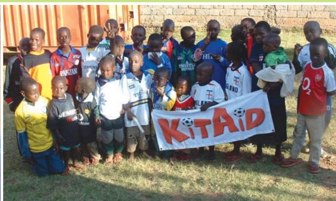
KitAid comes to town, Uganda