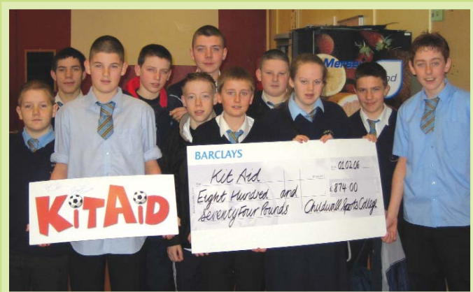
Childwall Sports College, Liverpool raise a huge amount for KitAid.

KitAid is a great way to introduce the idea of recycling to children in a way that they can have fun and give to someone far less fortunate than themselves. There are many schools that support us throughout the year and we are thankful to them all. We can genuinely say that the shirt which was much loved in this country will be loved just as much by the child that it gets passed on to.