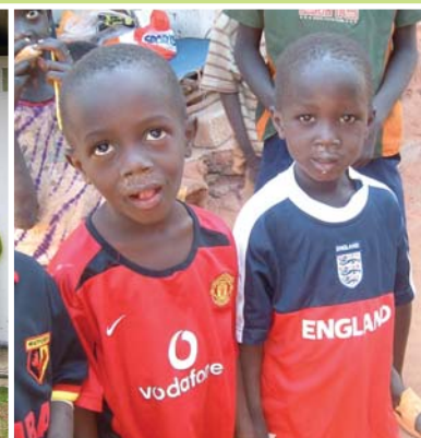
Boys with their new shirts, Gambia