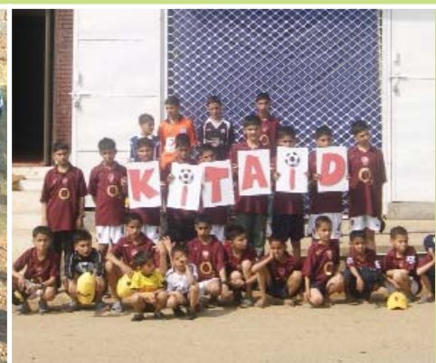
Earthquake victims in Kashmir receive Arsenal FC shirts

Catch up with the latest... online at www.3valleys.co.uk/kitaids