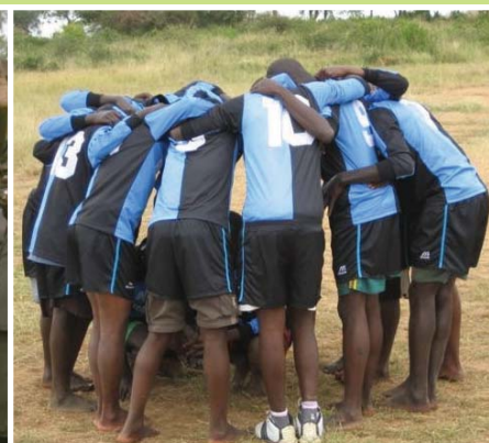
The Matiku team talk tactics, Kenya