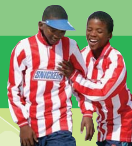
It's great to play football in South Africa