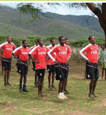
Warming up in Kenya