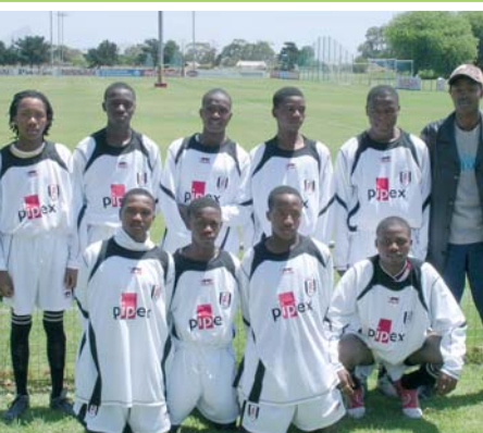
Fulham FC – African style