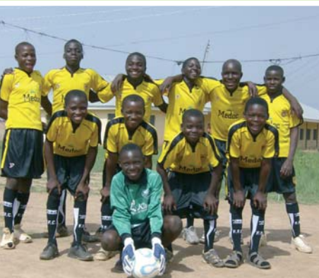
Sporting their new kit, Nigeria