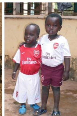
Ready to play, The Gambia