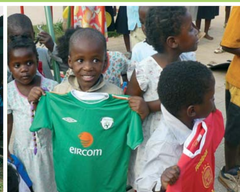
Shirts bring a big smile