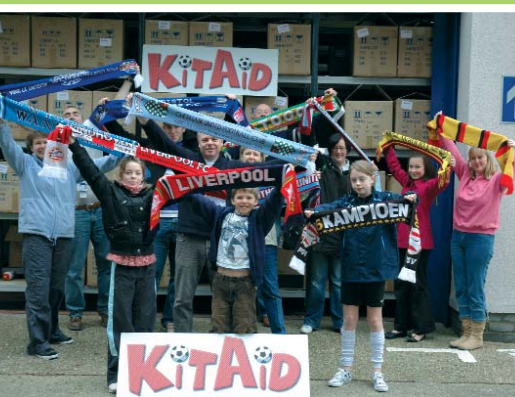
60 boxes packed in a morning