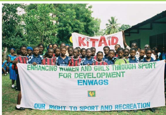
All kitted out, Sierra Leone