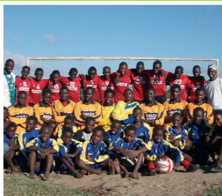
Proud players, Kenya