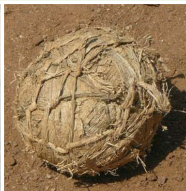
A football – Zambian style