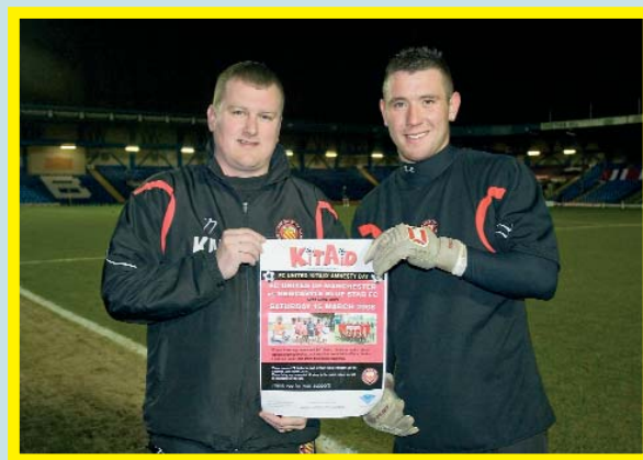
FC Utd of Manchester back another football shirt amnesty

We've had great support from football clubs all over the country from grassroots level to the Premiership. We would like to thank: Aston Villa, Arsenal, Colchester Utd, Liverpool, Watford, Fulham, Blackpool, Notts County, Man City, FC Utd of Manchester, Tranmere Rovers, Fleet Town, Chester City, Witton Albion, Ossett Town, Ossett Albion, Curzon Ashton and many more local football teams whose kit brings big smiles to the faces of people less fortunate across the world.