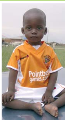
Blackpool baby, Nigeria