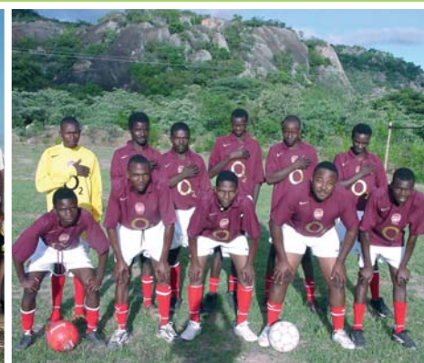
Working with the Salvation Army, Zimbabwe