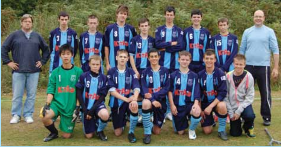
Fleet Town Colts supporting KitAid.

What have Barcelona, Aston Villa , Berkhamsted Raiders, Cottonmill FC (St Albans) and Fleet Town Colts got in common? They have all decided to give something back to their community and proudly wear a charity name on their shirt.