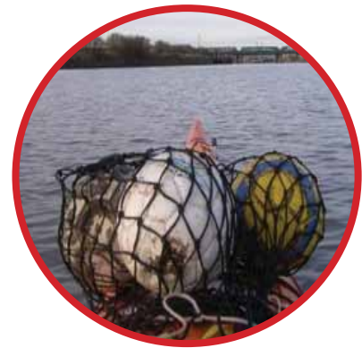
Lost balls – soon to find a new home.