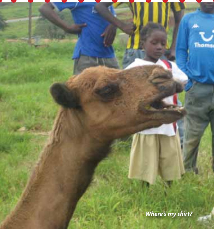
Where's my shirt?