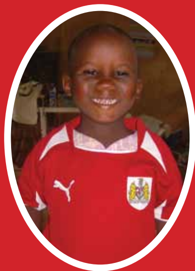
One very happy little man.

Football undoubtedly bridges the world. KitAid helps build those bridges of hope helping kit reach more than 35 countries. So if you can, please make sure your unwanted, redundant or last season team kit makes the journey to the heart of a global community. Make sure your much loved shirt gets appreciated far from home. Go on – be a donor!