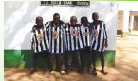
A new Newcastle Utd team, Kerewan, Gambia.