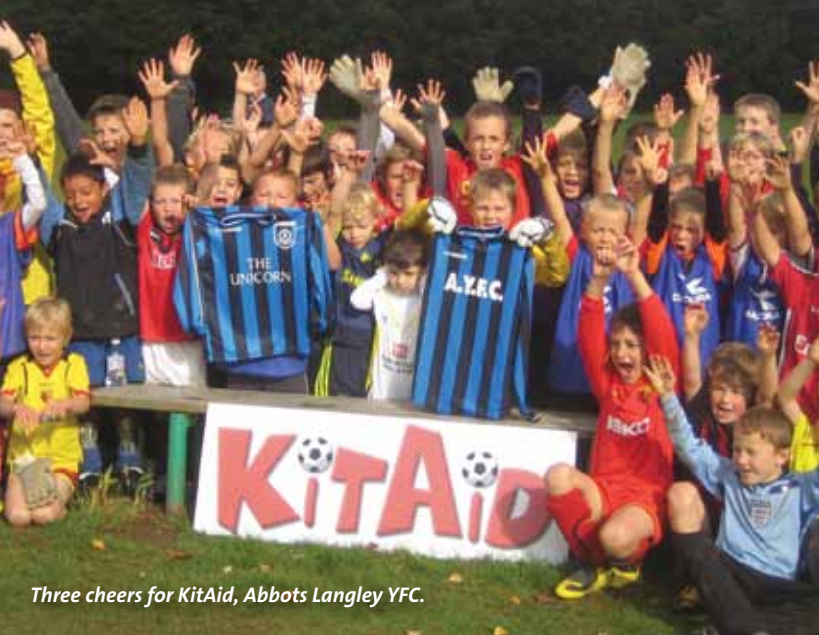
Three cheers for KitAid, Abbots Langley YFC.