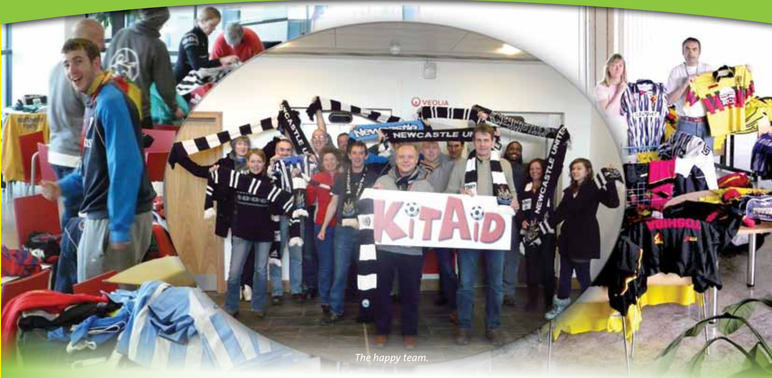
The happy team.