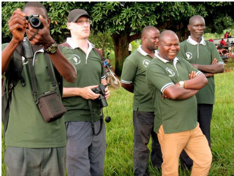
Members of BCCP enjoying the Final!

Also, big thanks to the staff of BCCP for their hard work organizing and supervising this year’s tournament.