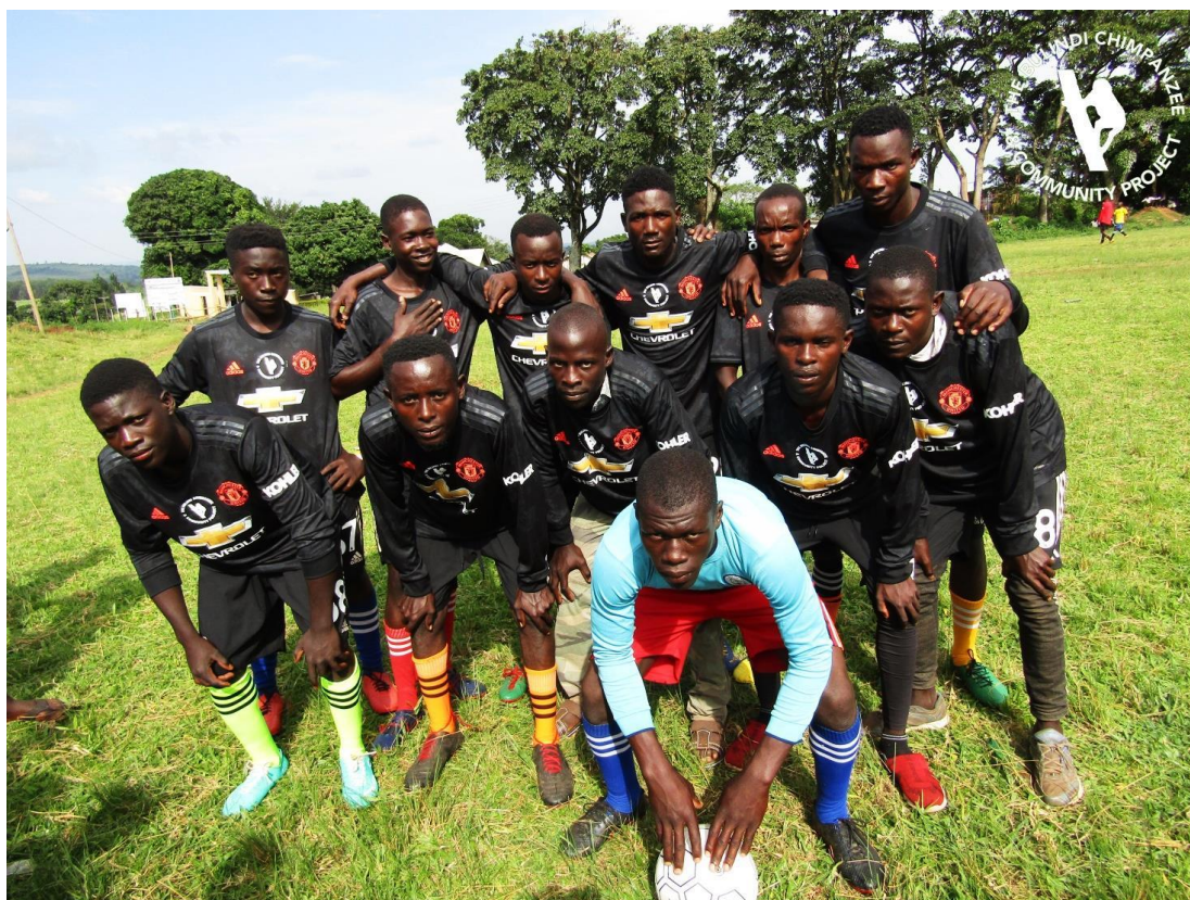
Kitabona FC sporting their brand new Man U kits donated by KitAid!