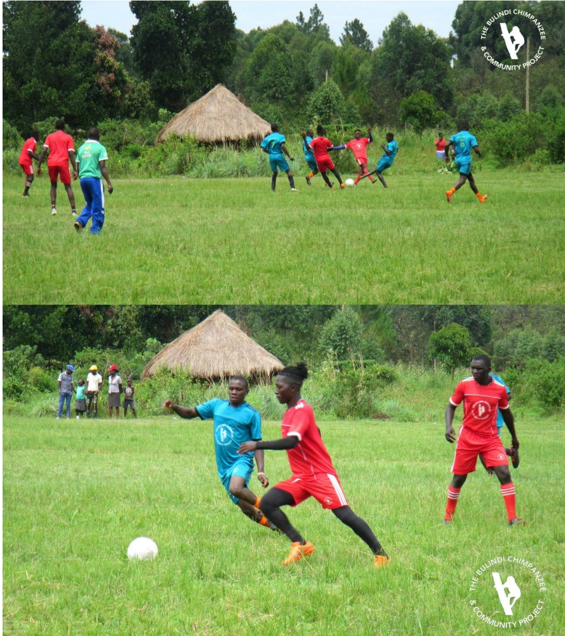
First round action from the match between Bulindi teams Mparangasi FC (red) and Nyaituuma FC (blue). In a reversal of last year's matches, Nyaituuma came out on top this time.