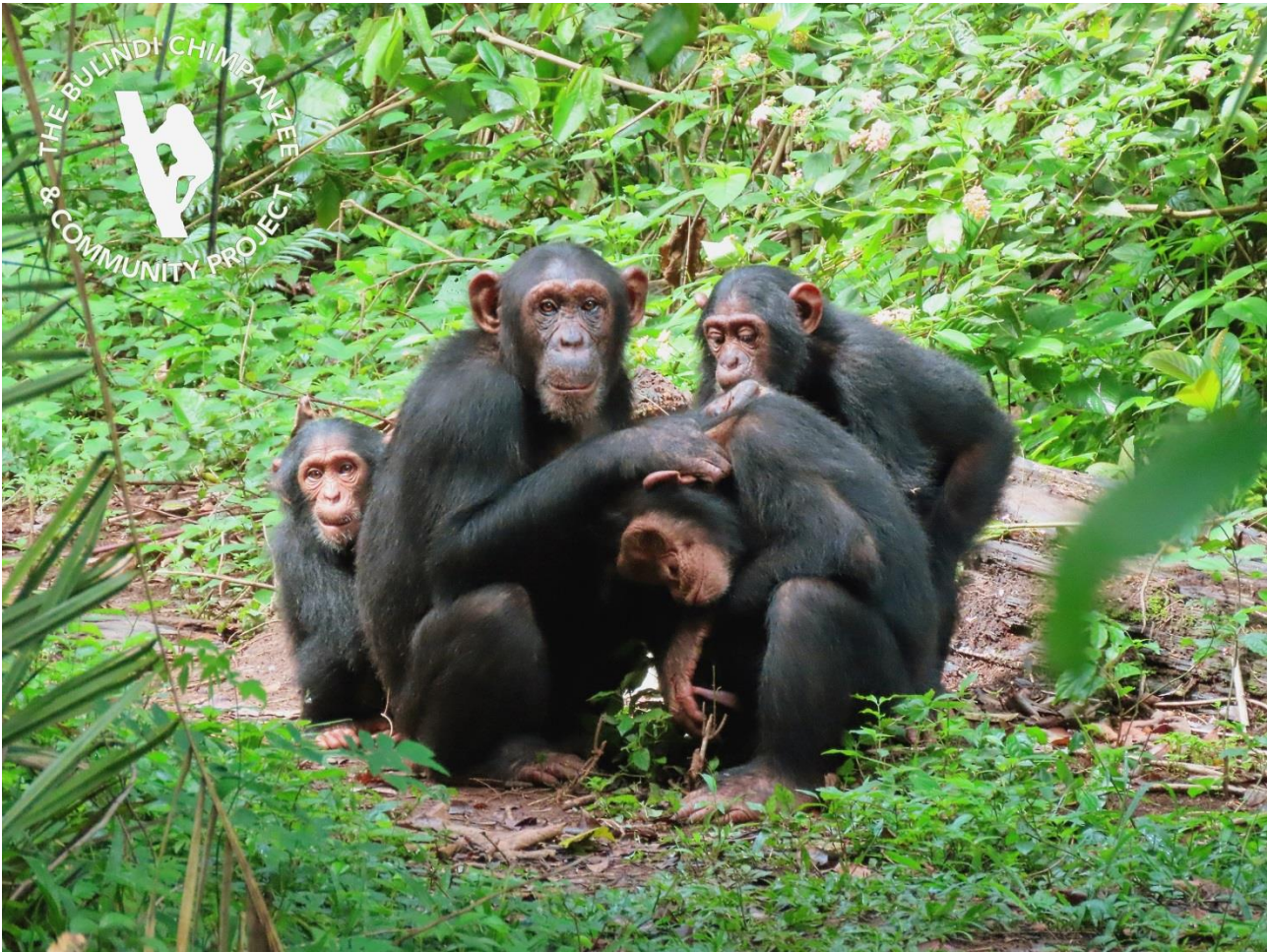
A family of wild chimpanzees in the forest in Bulindi

messages about environmental issues, the chimpanzees and conservation, helping to reduce misconceptions and mitigating tension between local residents and chimpanzees.