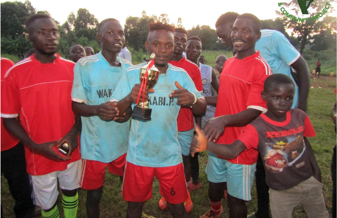
Wagaisa FC players (and young fans!) celebrate with the trophy after their popular 2-1 win over Kyabigambire Central FC in a dramatic evening final.

The 2021 Chimpanzee Football Tournament was undoubtedly the most successful tournament we've held to date: after the final, local leaders thanked us and commented that it was one of the best football tournaments ever held in the region. News of the tournament was aired by several local news and TV stations.