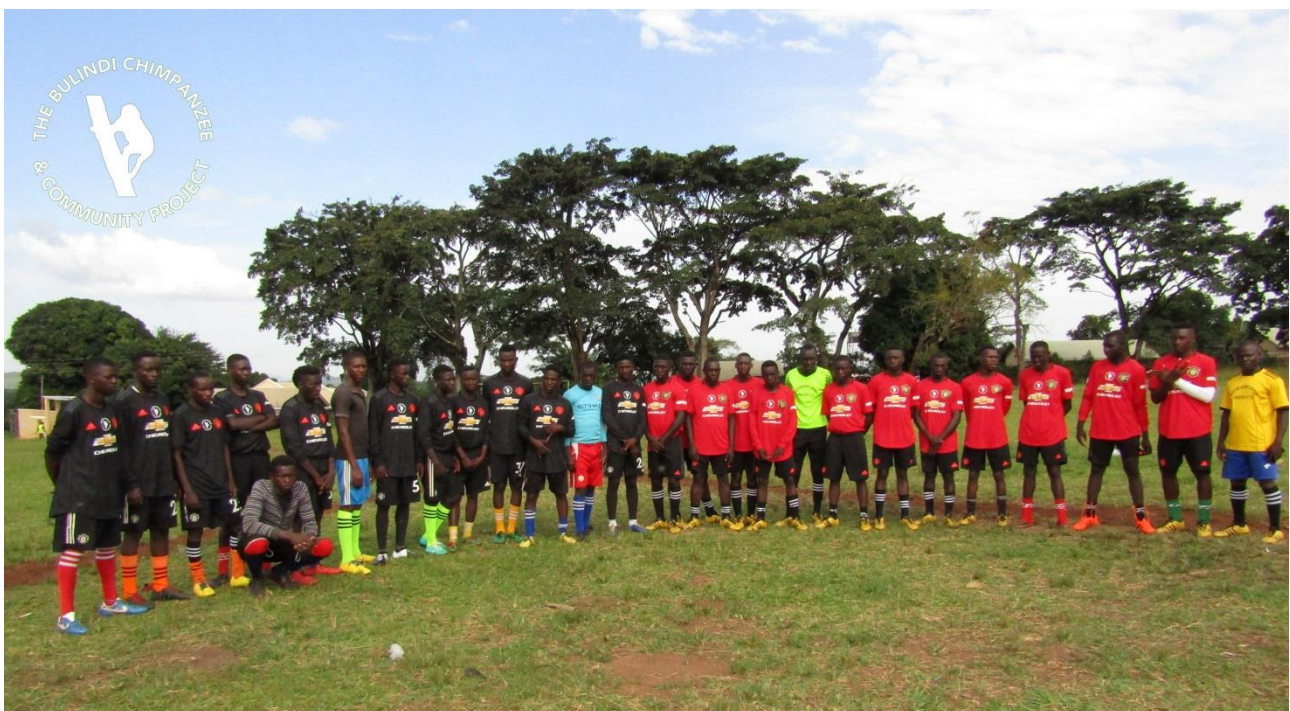
Kitabona FC and Kiziranfumbi FC prepare for their match wearing their new Man U kits donated by KitAid