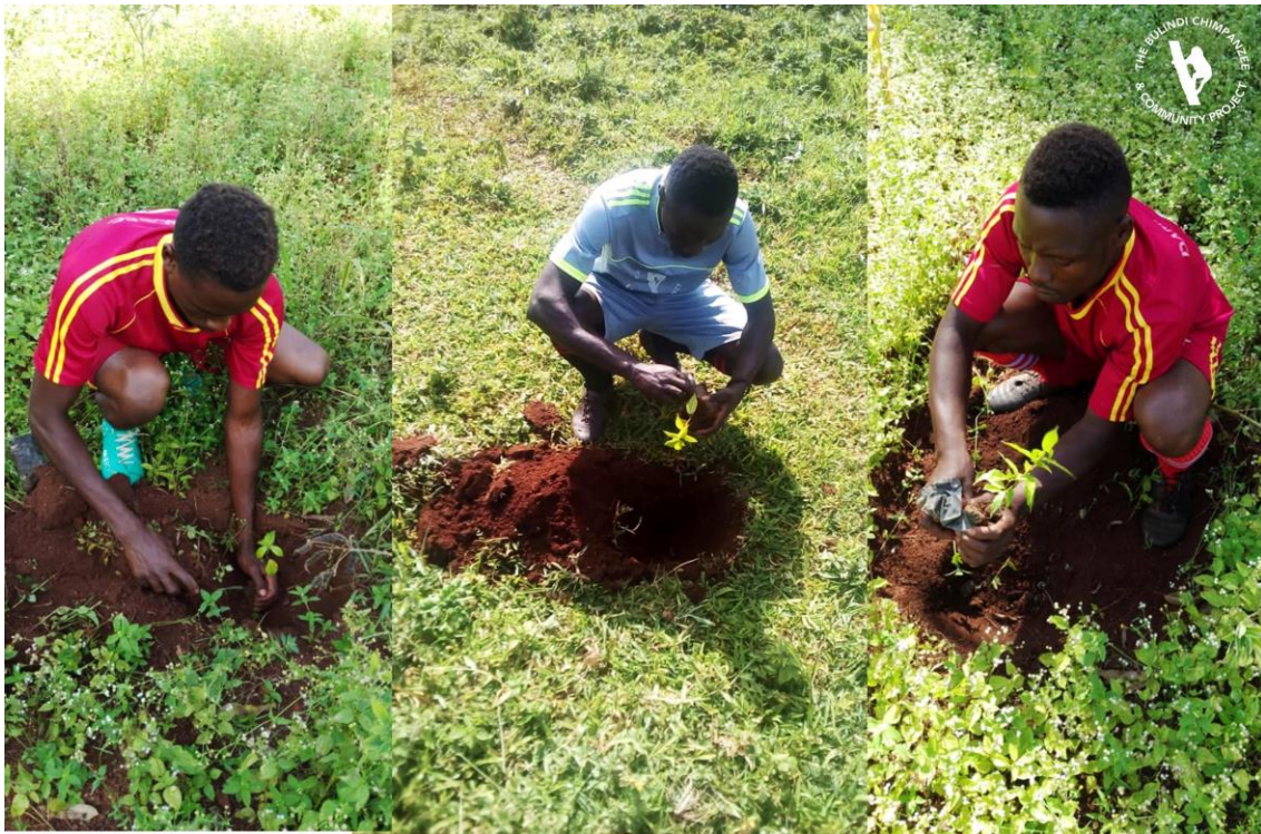
Before matches, players were invited to participate in a tree planting exercise to instil the spirit of conservation. On the left and right are players from Kyabasengya FC; at centre is a player from Kasunga FC.