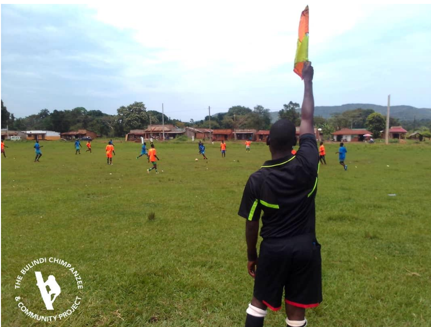
A linesman in action during the Kyakamese vs Kiseeta game.