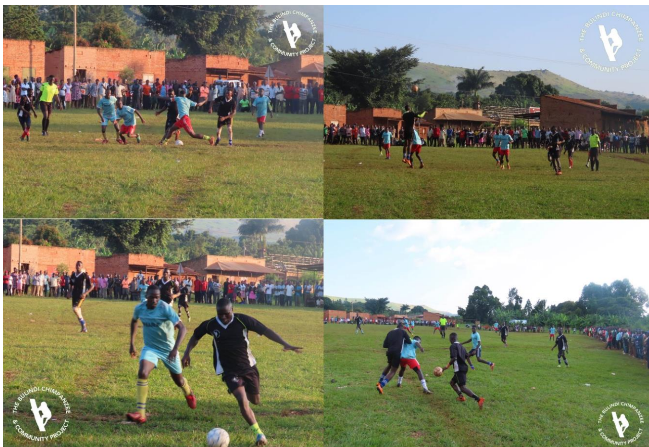
Spot the ball: Action from the final between Wagaisa FC (in blue kit) and Kyabigambire Central FC (in black kit)

The final proved to be an exciting and high quality match with close to 1000 spectators eagerly following the action. By half-time, home favourites Wagaisa were 2-0 up and the crowd of supporters were already sensing victory. But with just 15 minutes left of the match, a striker for Kyabigambire Central fired in a fantastic goal. With nothing to lose, Kyabigambire continued to pile on the pressure while Wagaisa showed signs of losing confidence. It appeared that Kyabigambire would equalise at any time and the match might go to extra time and even on to penalties. In the end though, it wasn't to be, and Wagaisa FC emerged victorious, winning the Chimpanzee Football Tournament for the first time in four attempts. It was a popular and very well-deserved win!