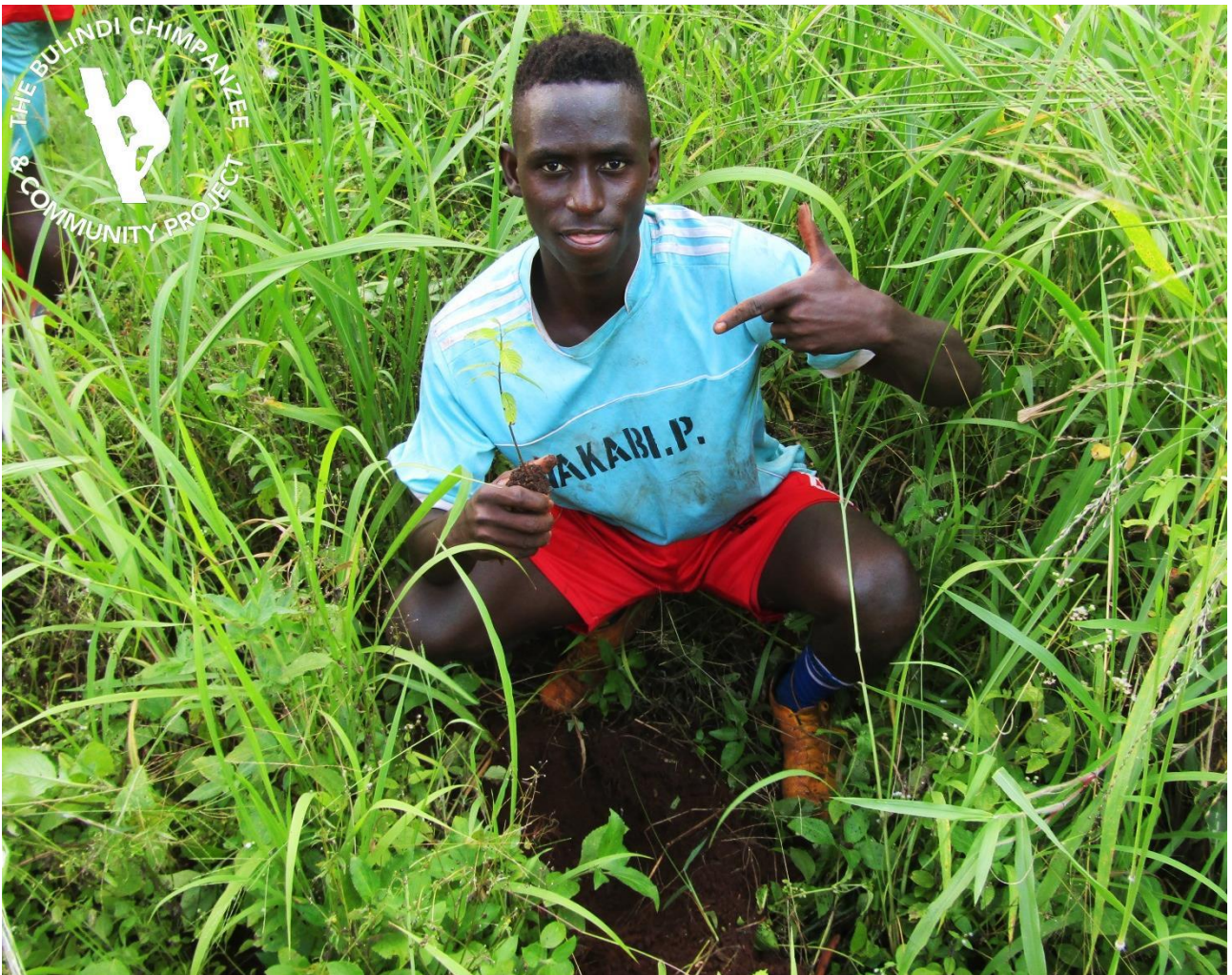
A player from Wagaisa FC plants a tree seedling ahead of the final with Kyabigambire Central FC

Prior to the final, a tree planting exercise was carried out involving local leaders, BCCP staff, and players from Wagaisa and Kyabigambire Central, as a reminder of the conservation issues at the heart of the tournament. Tree seedlings (supplied by BCCP from our tree nurseries) were planted in the grounds of a church and primary school adjacent to the football pitch.