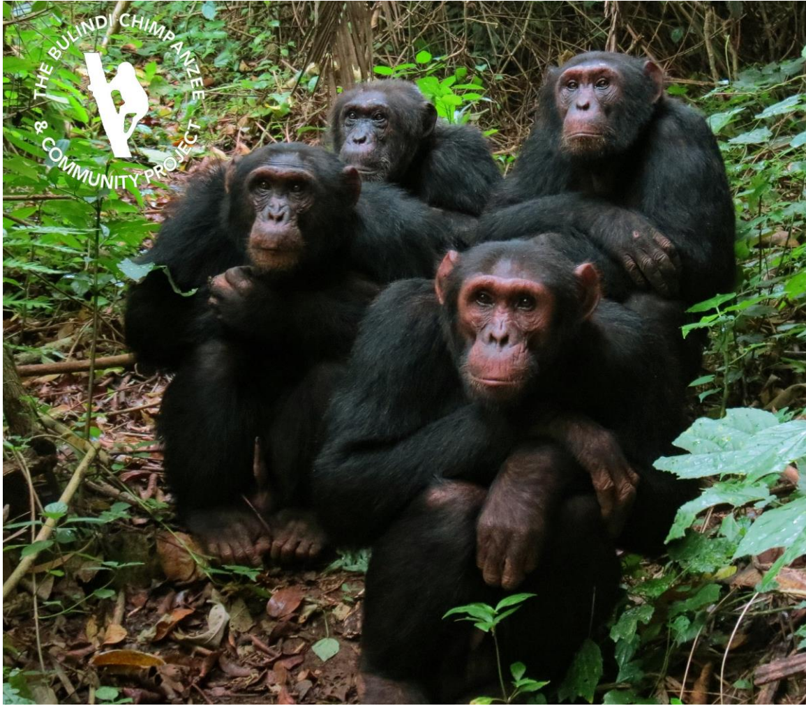
Four males of the Bulindi chimpanzee community engrossed in the second playoff between their two home teams, Mparangasi FC and Nyaituuma FC.