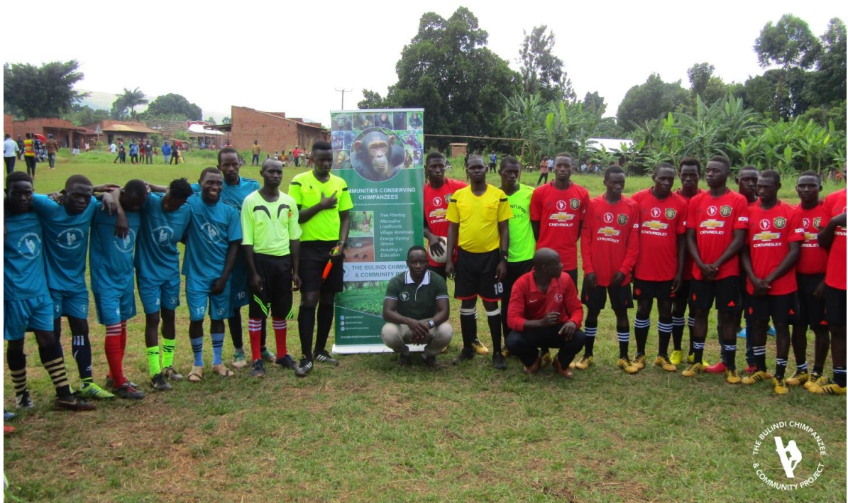
Nyaituuma FC (left) and Kiziranfumbi FC (right) before their quarter-final match