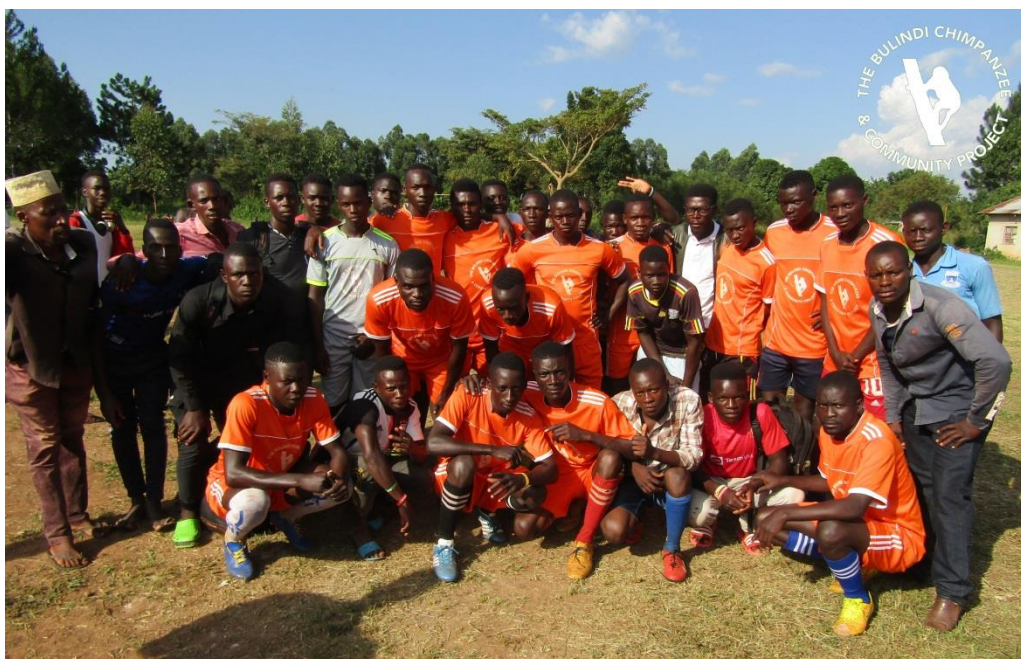
Buhamba FC (and entourage): Buhamba made it to the quarter finals for the first time this year.